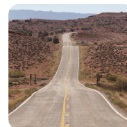
Road Trip USA!