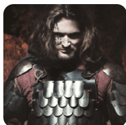
Peasants, Princes and Pestilence