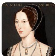
Off with Her Head!